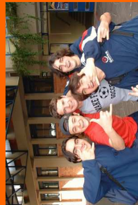
American and Brazilian students in Brazil